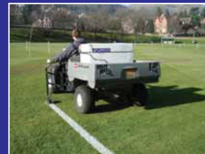
SUPERIOR LINE DEFINITION