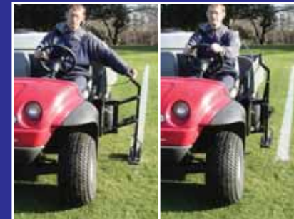
PATENTED RETRACTING ARM