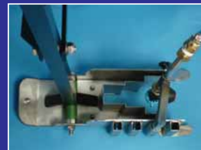
QUICK AND EASY LINE WIDTH ADJUSTMENT