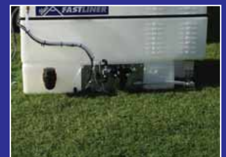
INTEGRAL WATER FLUSH TANK