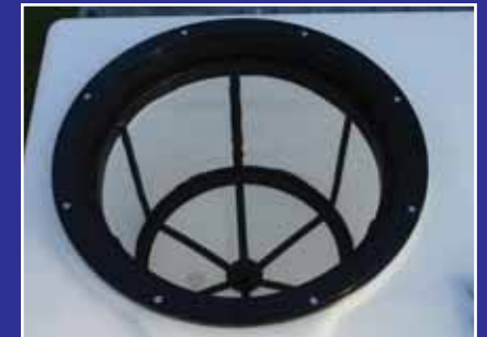
LARGE FILLING APERTURE WITH STRAINER