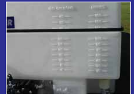
40 GALLON CALIBRATED TANK