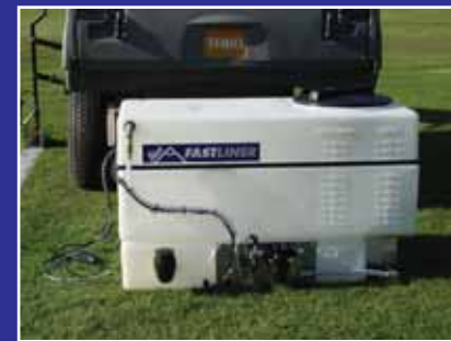
QUICK MOUNT SYSTEM

Combining high speed marking with quality engineering and unique patented features plus the ability to be removed quickly from the host vehicle making this an extremely versatile option.